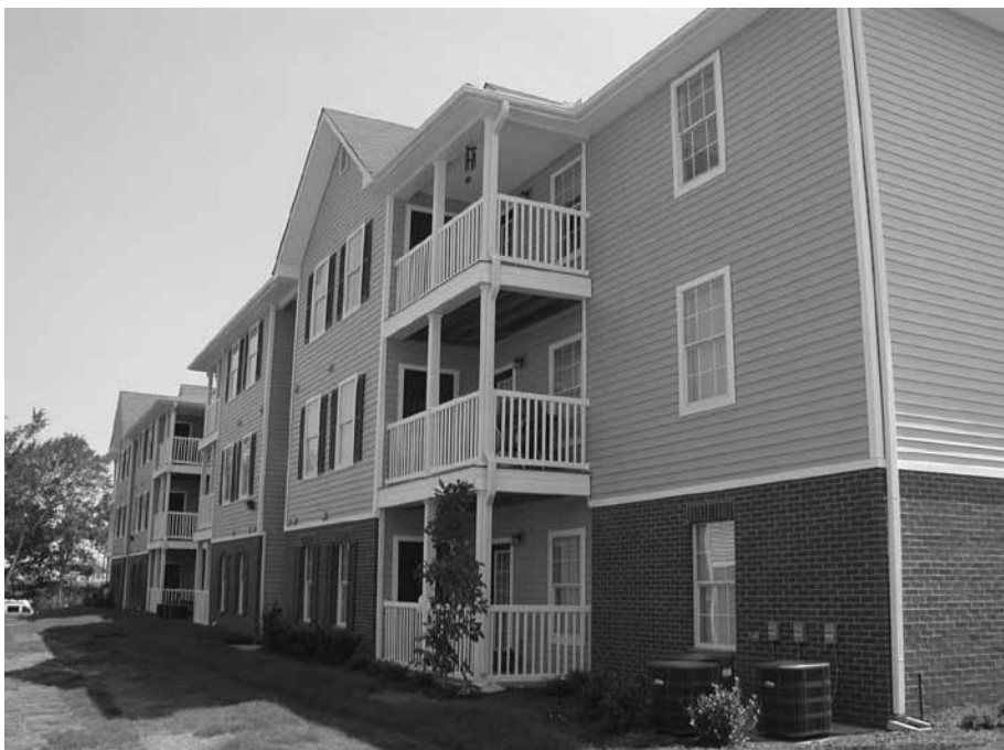
Cordova Campus Student Housing

Students who want to add or drop a course after the official close of registration day must do so at the Academic Records Office at the Cordova campus or at the Director's Office at the Northeast Campus. The $5 fee is payable at the Business Office.